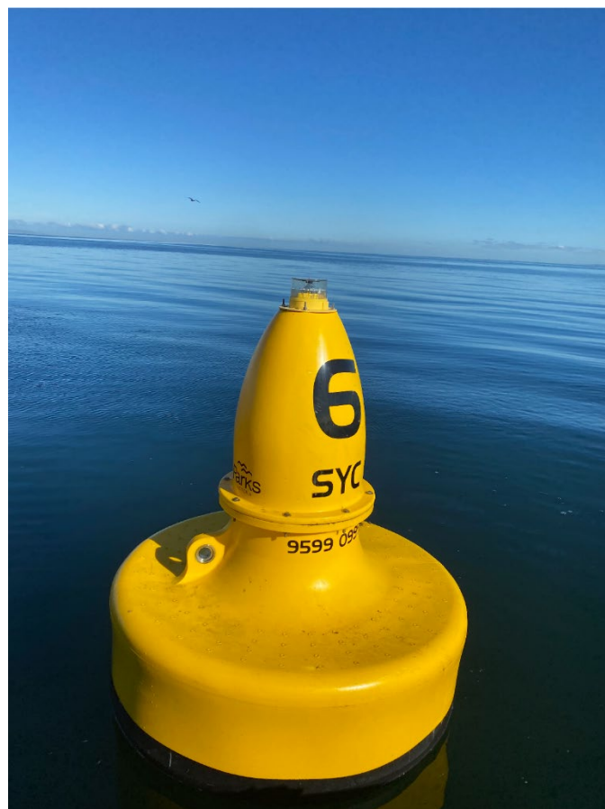
Sandringham Yacht Club Buoy 6

This notice is a direction of the Harbour Master pursuant to section 232 of the Marine Safety Act 2010 (Vic) The requirements of section 232(2) have been taken into account.