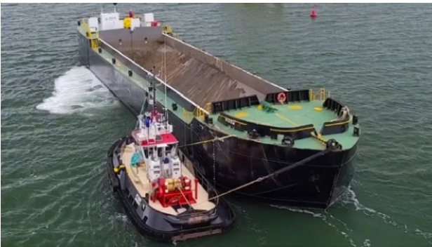
H1201 & H1202 - SPLIT HOPPER BARGES