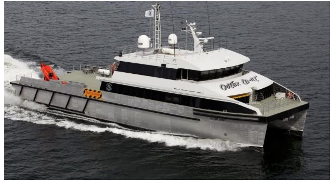
MV OUTER LIMIT

This notice is a direction of the Harbour Master pursuant to section 232 of the Marine Safety Act 2010 (Vic) The requirements of section 232(2) have been taken into account.