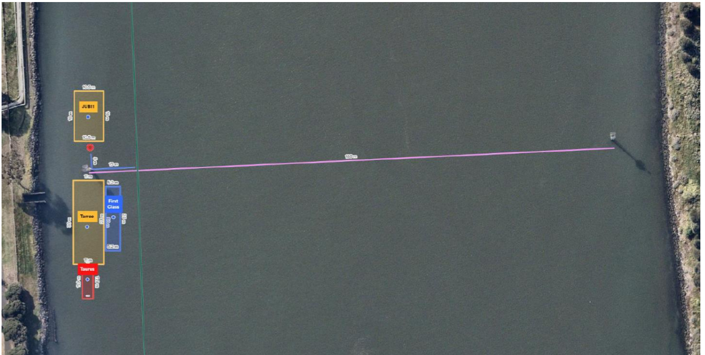
Work vessels and barges plan - Configuration #2

This notice is a direction of the Harbour Master pursuant to section 232 of the Marine Safety Act 2010 (Vic) The requirements of section 232(2) have been taken into account.