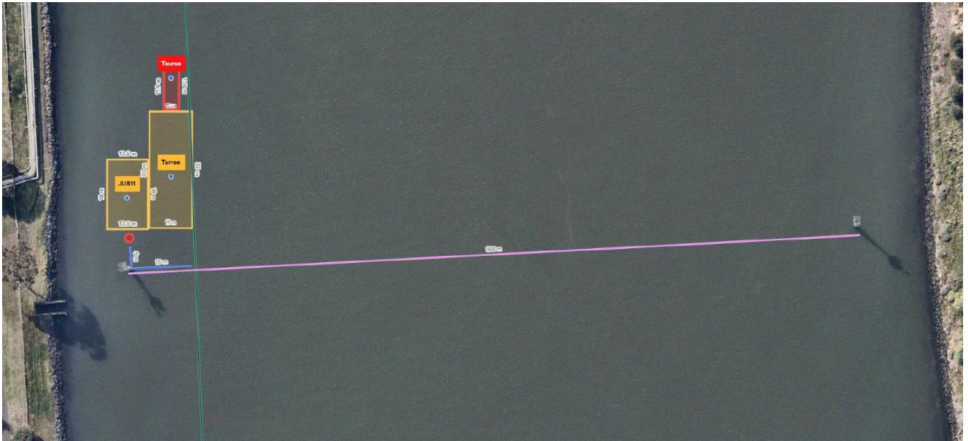
Work vessels and barges plan - Configuration #1