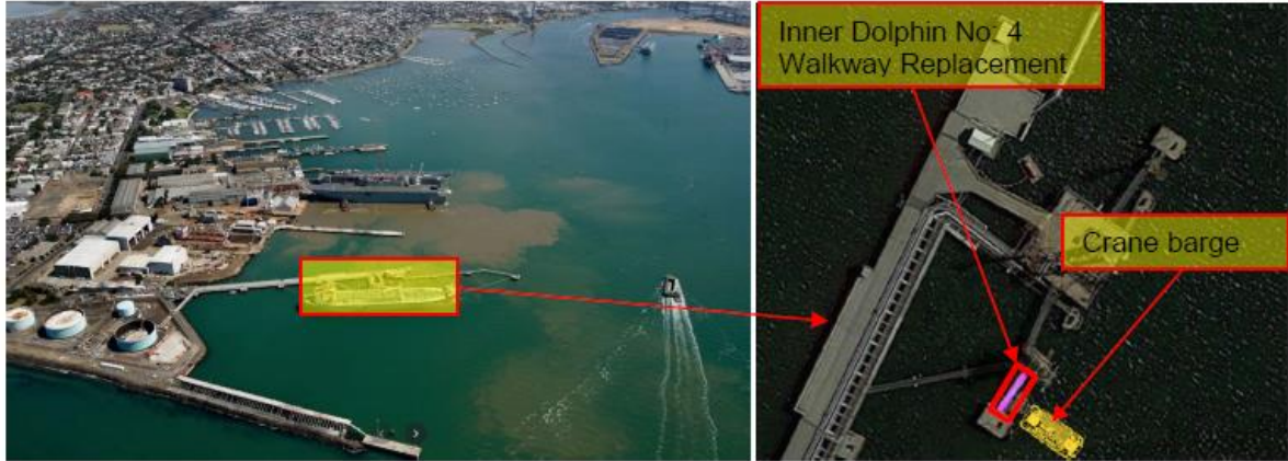
Figure 1; Gellibrand Pier