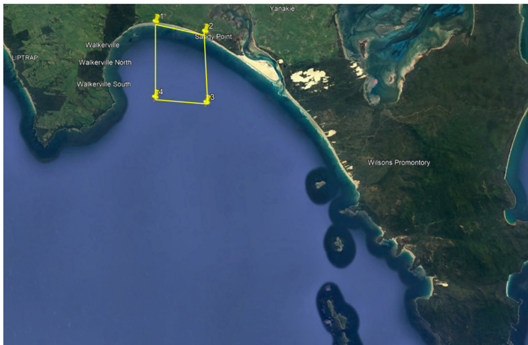
Figure 1 indicates the operational area. The survey area boundary is indicated in Table 1 below also.

Although the USV is uncrewed, it is crewed throughout the 24 hour operation, piloted remotely using 360 degree cameras and other navigational aids.