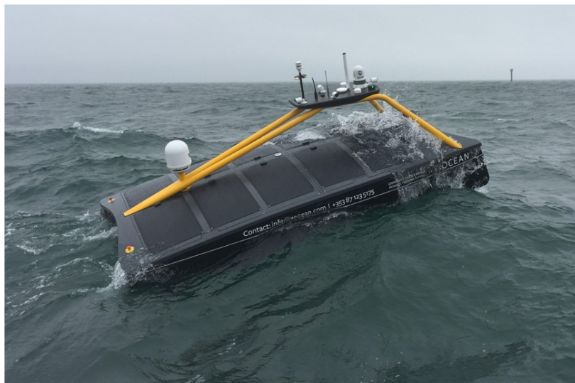
Figure 1: XO-450 USV

The USV sends real time images and situational awareness data over satellite to a team of operators keeping watch and controlling the vessel remotely 24/7.