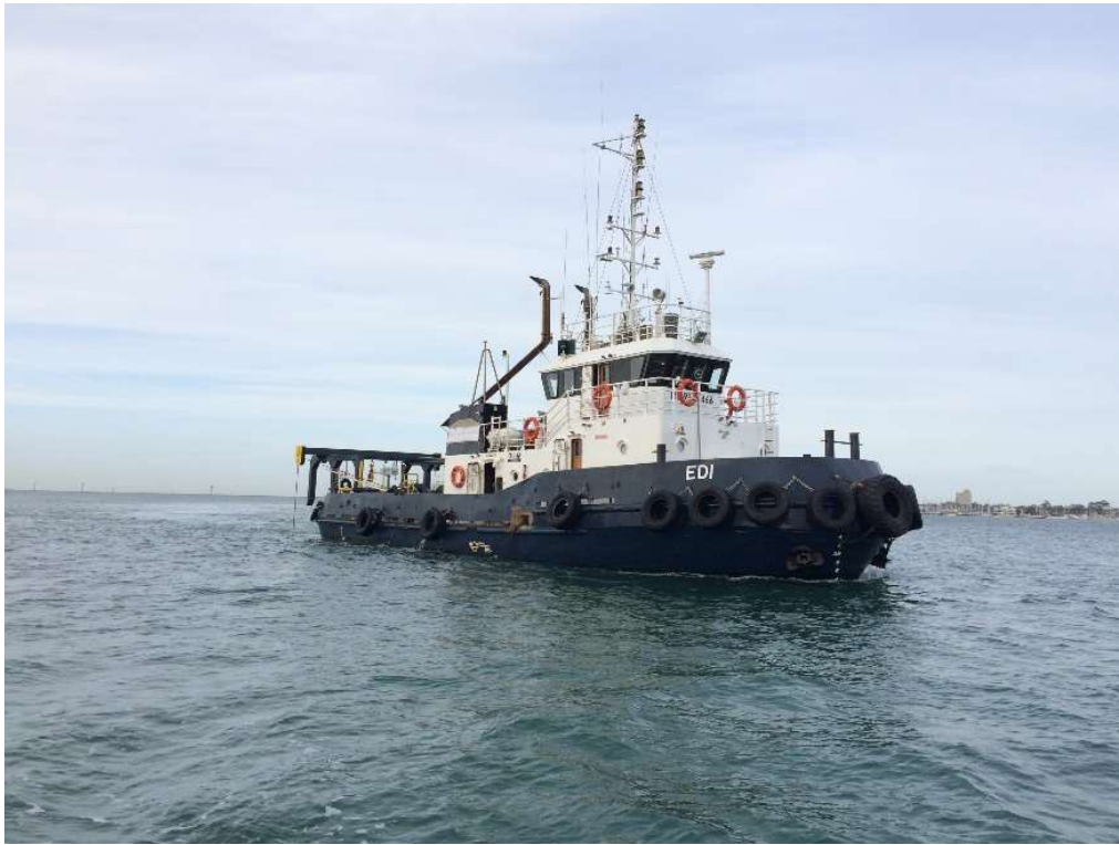
Sweep tug Edi

This notice is a direction of the Harbour Master pursuant to section 232 of the Marine Safety Act 2010 (Vic) The requirements of section 232(2) have been taken into account.