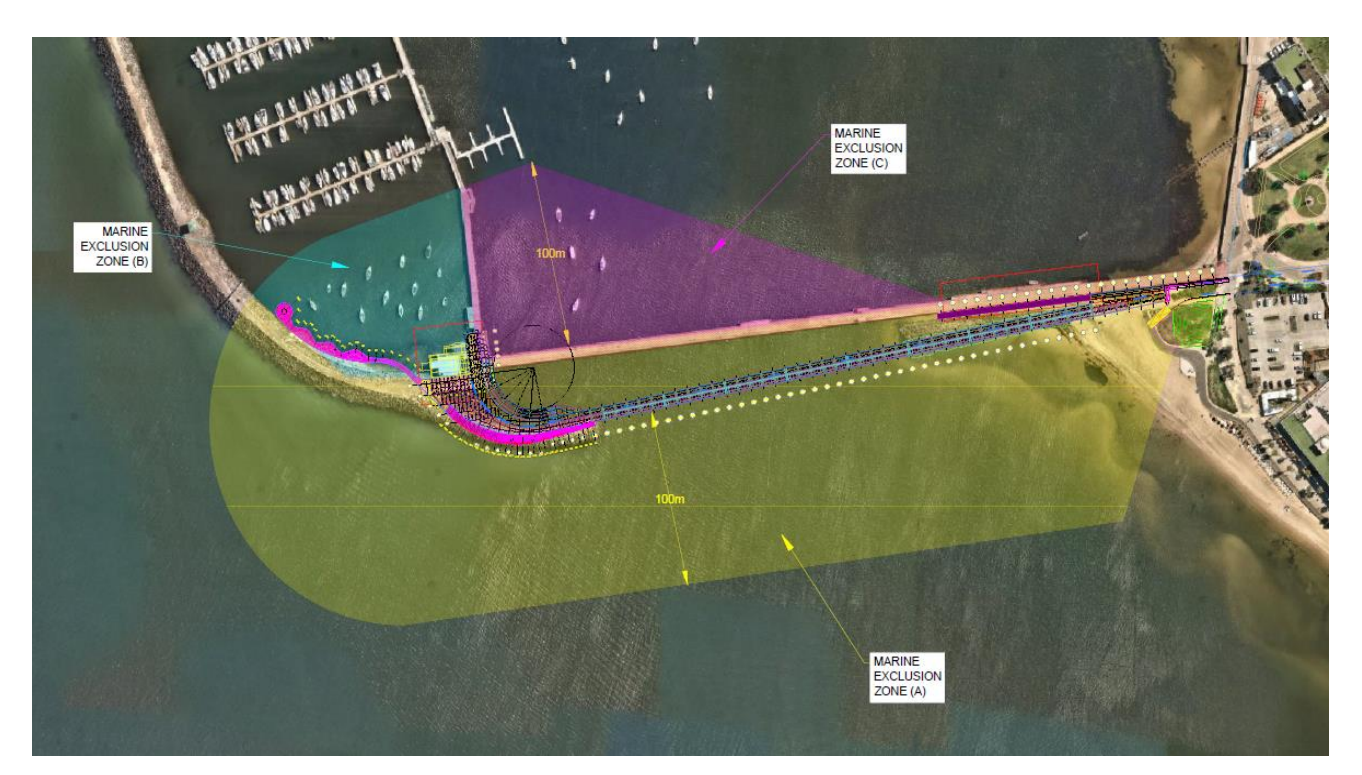
Map 1. St Kilda Pier Redevelopment project works Set Aside areas.