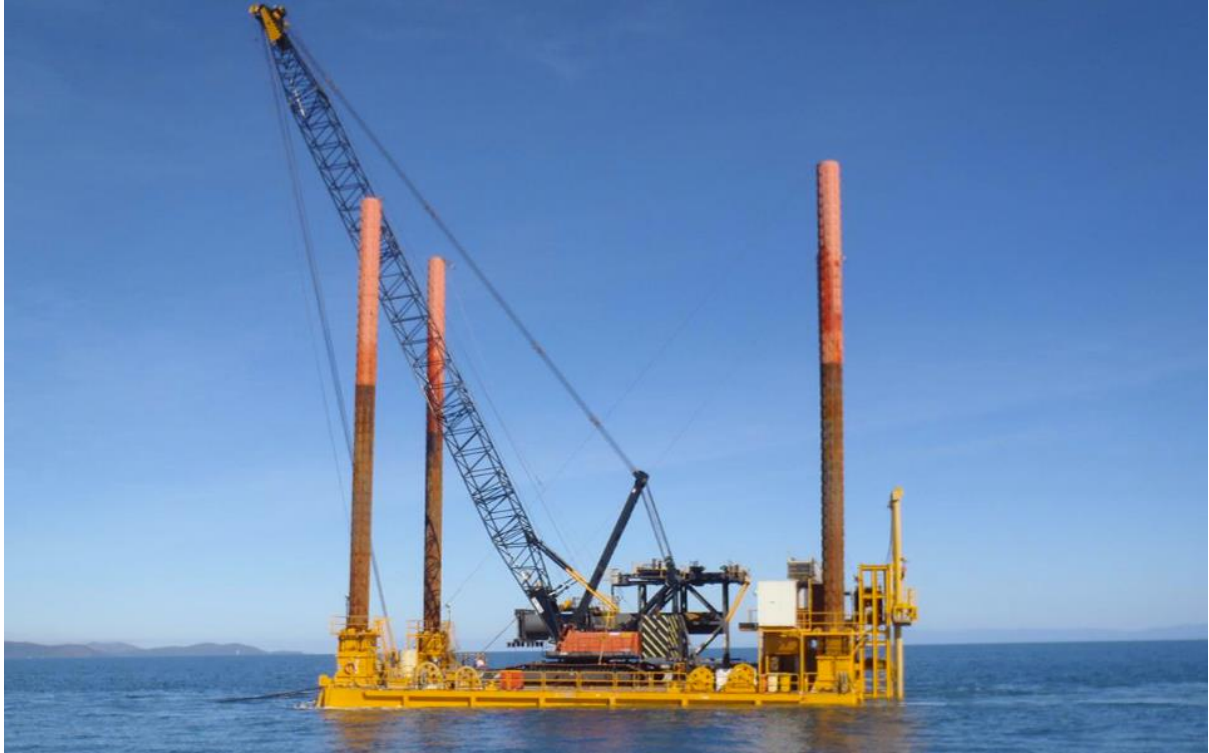
SEP FUJI BARGE

This notice is a direction of the Harbour Master pursuant to section 232 of the Marine Safety Act 2010 (Vic) The requirements of section 232(2) have been taken into account.