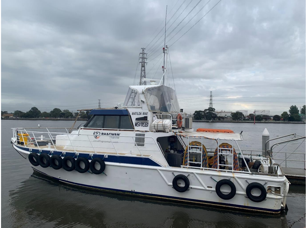
MV MATILDA MAE