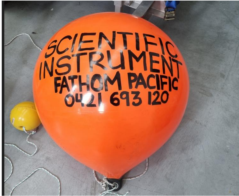
Surface marker buoy