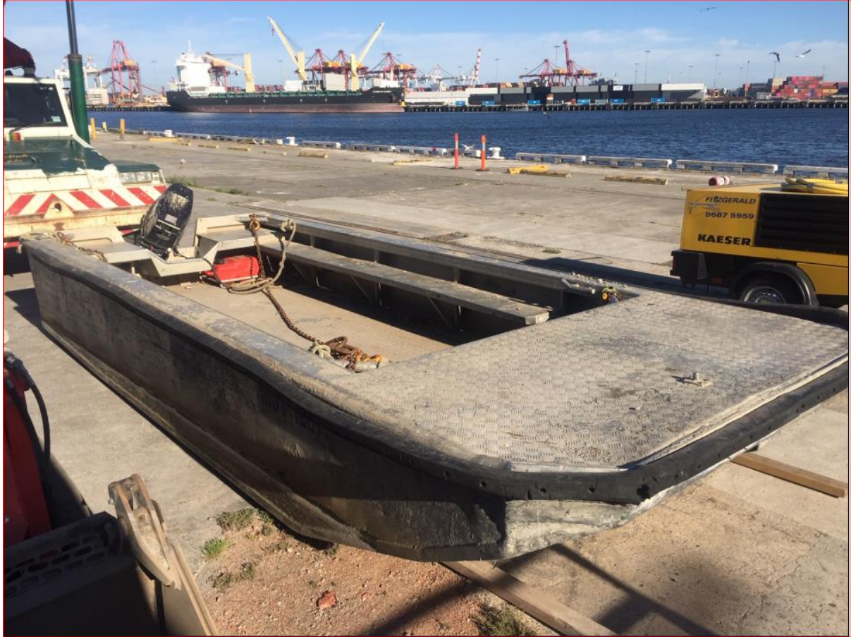
Work Boat 2.5m x 5m

This notice is a direction of the Harbour Master pursuant to section 232 of the Marine Safety Act 2010 (Vic) The requirements of section 232(2) have been taken into account.