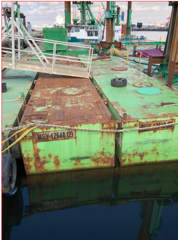
Floating Pontoon 4.8m x 12m

This notice is a direction of the Harbour Master pursuant to section 232 of the Marine Safety Act 2010 (Vic) The requirements of section 232(2) have been taken into account.