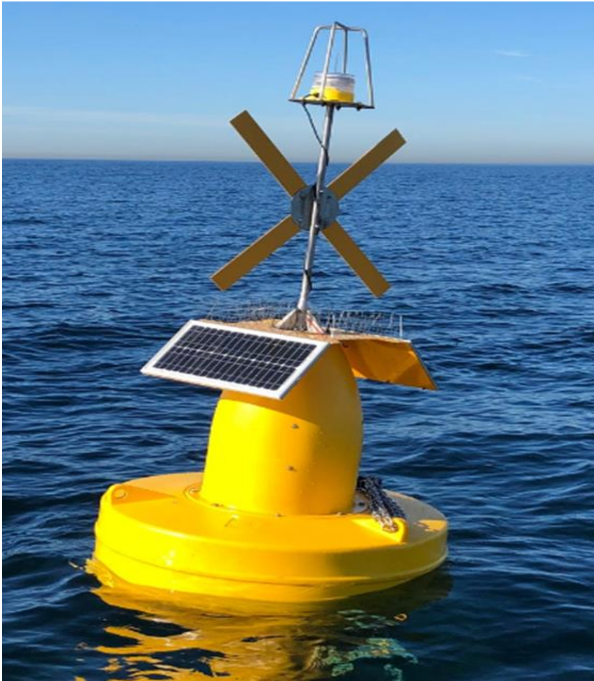
YELLOW MONITORING BUOY WITH SPECIAL MARKER

This notice is a direction of the Harbour Master pursuant to section 232 of the Marine Safety Act 2010 (Vic) The requirements of section 232(2) have been taken into account.